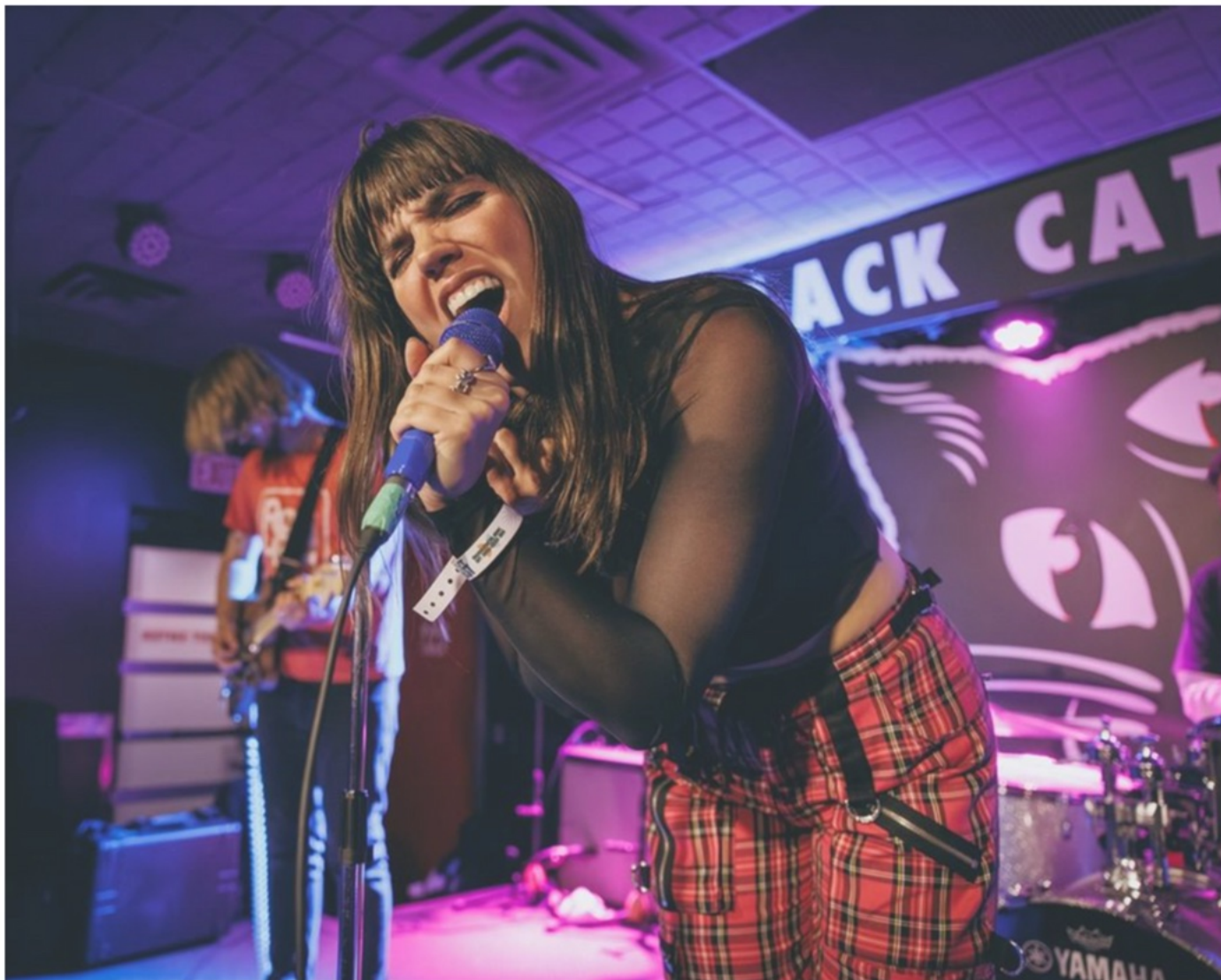
It was a wrap to the festival | @breakoutwest on instagram