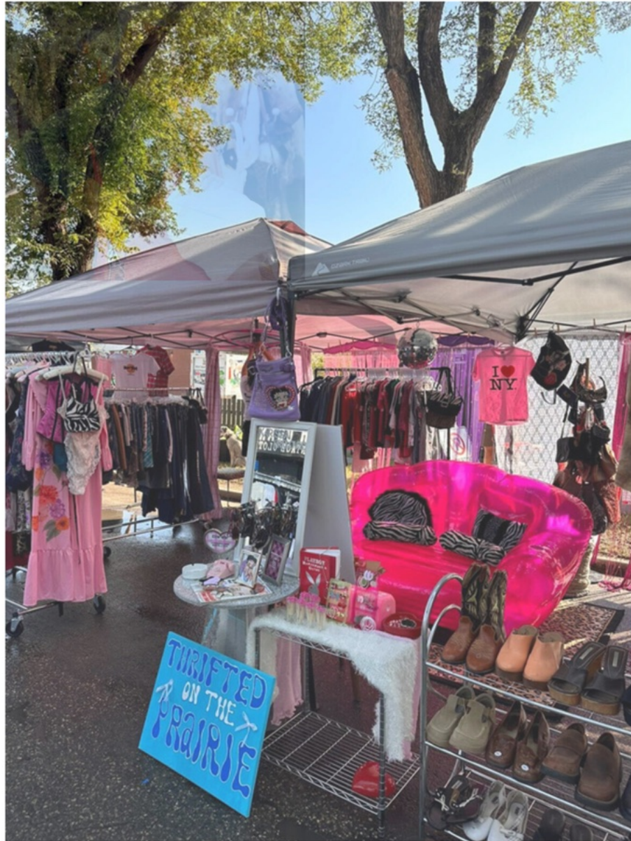
Thrifting on the prairie | @karissapreloved on instagram

Remember to wait your turn in the fitting rooms (or the makeshift drapes they put around). If you make eye contact with someone who seems