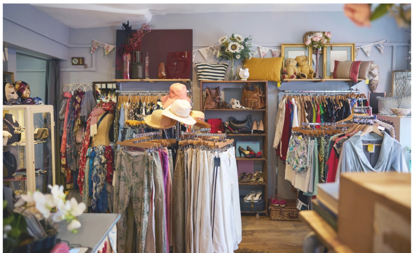
Interior Of Charity Shop Or Thrift Store Selling Used And Sustainable Clothing And Household Goods

If you're new to thrifting, don't worry about not knowing what to do. Just be patient, and you'll figure it out! From one thrifting girlie to another, good luck and happy thrifting!