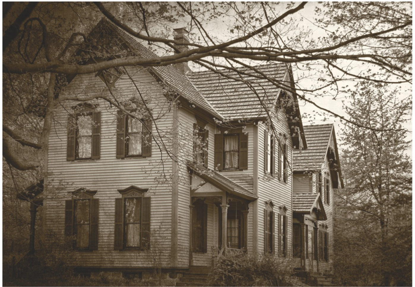
Old haunted house

This movie, similar to Coraline , uses claymation. Each of the characters is a clay puppet that is maneuvered to display distinct facial expressions and body language within the story. The storytelling is accomplished through writing character design and scenery, and it is masterfully done in every