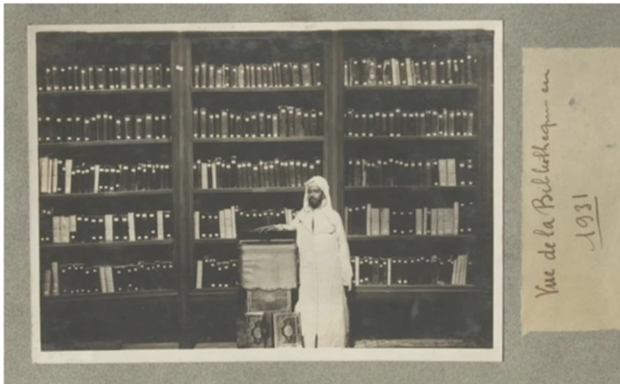
Librarian at al Qarawiyyin in 1931

Muslim-led student groups like the University of Saskatchewan Muslim Students' Association and Islamic Relief USask, are hosting a variety of events. Specifically, the Islamic Dawah Society holds weekly sessions covering significant historical events that shape our contemporary context. This follows their incredibly successful decolonizing series covered last year. These sessions take place every Thursday, starting on October 3rd, from 5:00 p.m. to 7:00 p.m. in the Health Sciences Building. To stay updated, be sure to follow their Instagram page: @ids.usask.