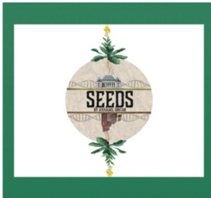
Seeds Promotional Poster | USask College of Arts and Science