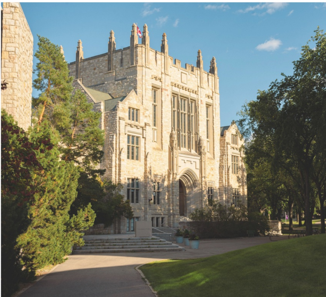
Thorvaldson building on campus