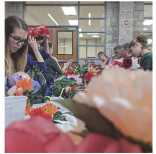
Past vinok (headress) making event | USUSA