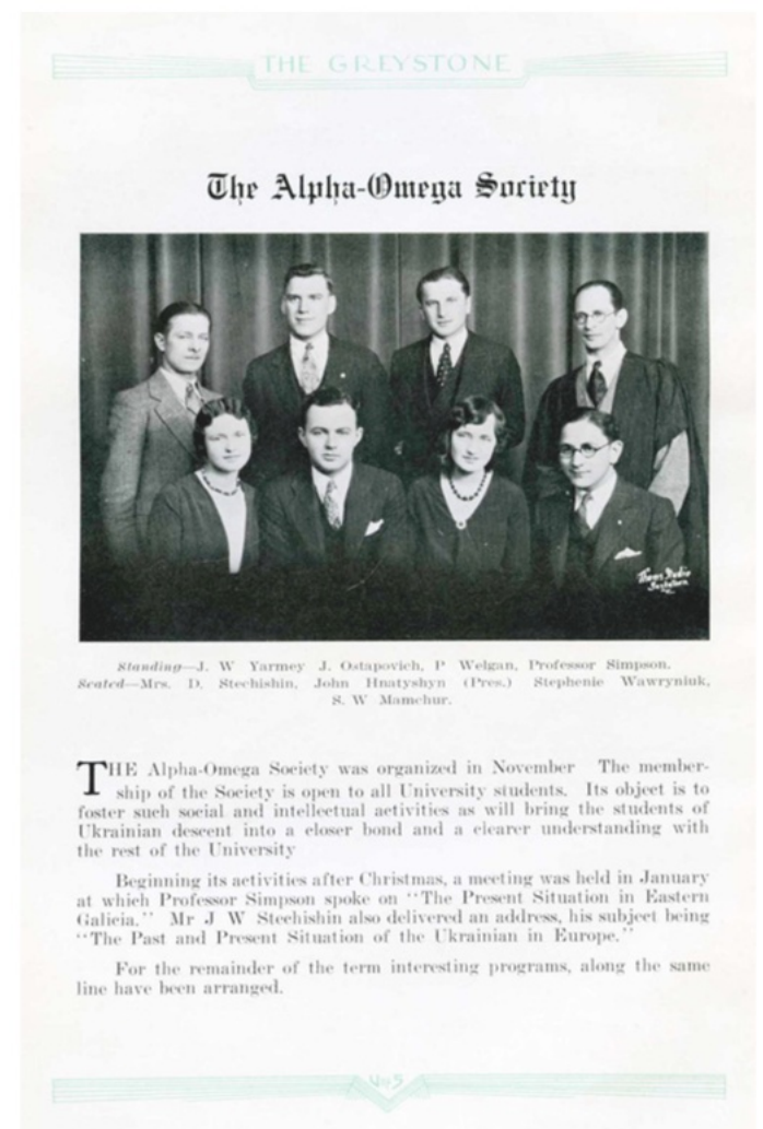
Very first Alpha Omega Society executive