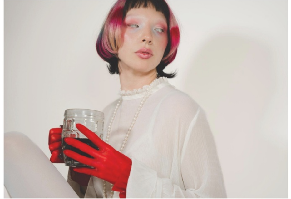
Creative portrait