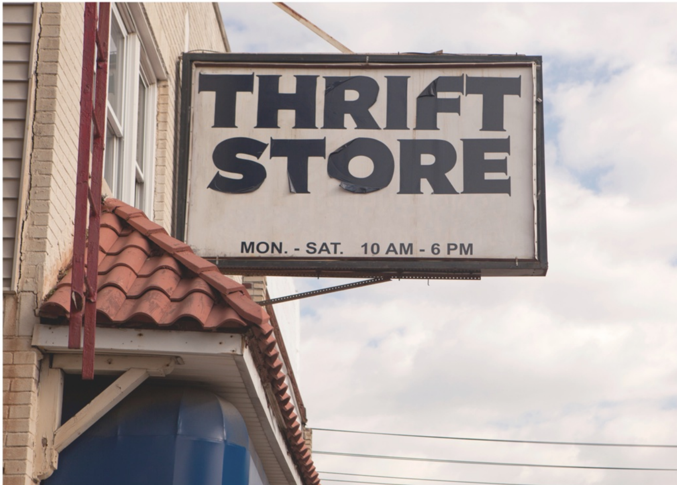
Thrift store sign

If you're looking to change your style or incorporate new pieces into your closet, consider donating items you do not need anymore to your friends, family or charities (for example, ISSAC is accepting donations for warm winter wear!)