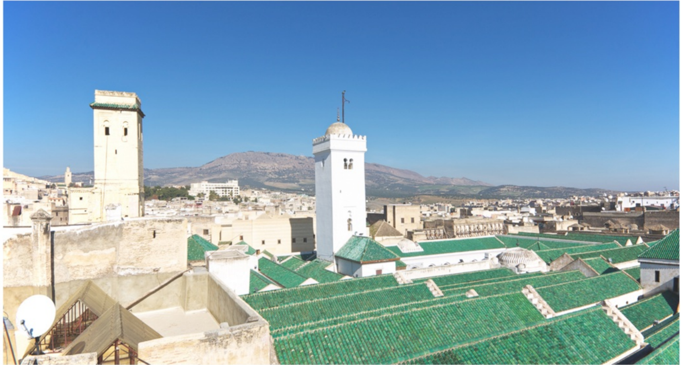
Al-Karaouine (Al-Qarawiyyin) University, Fez, Morocco

The scientific method, which constitutes the basis of modern research, originated from the works of a Muslim scholar. Ibn Al-Haytham, commonly known as Al-Hazen, pioneered the process of testing hypotheses and verifying results through observation and experimentation. His innovative and methodical approach which emphasized creative and critical thinking, predates Renaissance scientists by nearly five centuries.