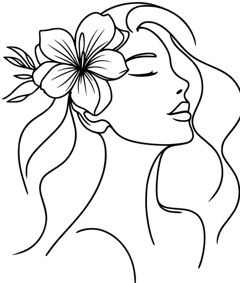
Beautiful woman face with flower line art

It's okay to feel down at times, but it is crucial to be able to recognize what's causing it and how to go about elevating your mood. Take care of yourselves out there, as it becomes even more crucial to do so since the academic year is only going to get busier.