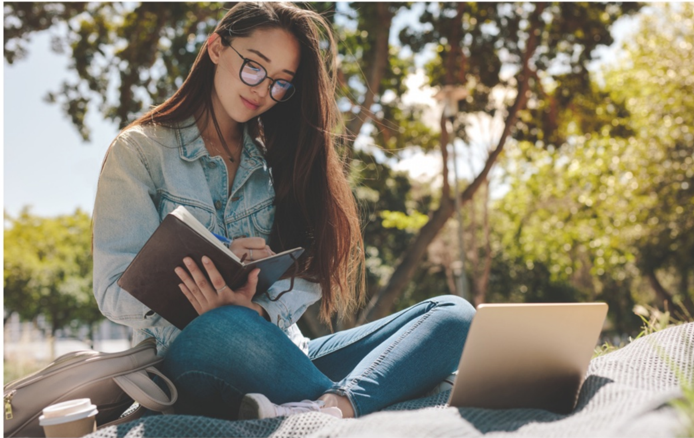
Young woman studying sitting outdoors

Ultimately, the trick to making studying a fun experience is by incorporating a variety of study techniques and methods. Studying will likely not become dull if it's not an identical process every day. Once you're able to curate your own routine, the studying process will not only become more enjoyable but it'll also be appreciated more.