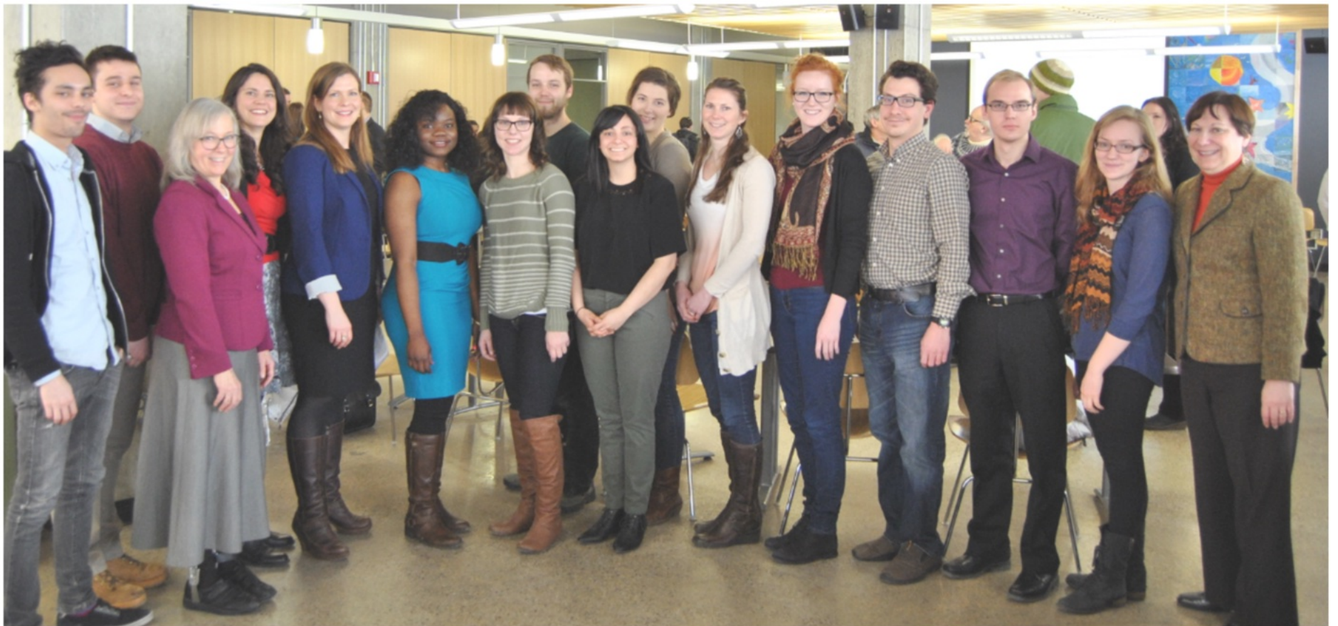
First Issue Celebration (2014) | USURJ

Please join us in congratulating USURJ on 10 years of promoting excellence in undergraduate student research, success, and collaboration at USask!