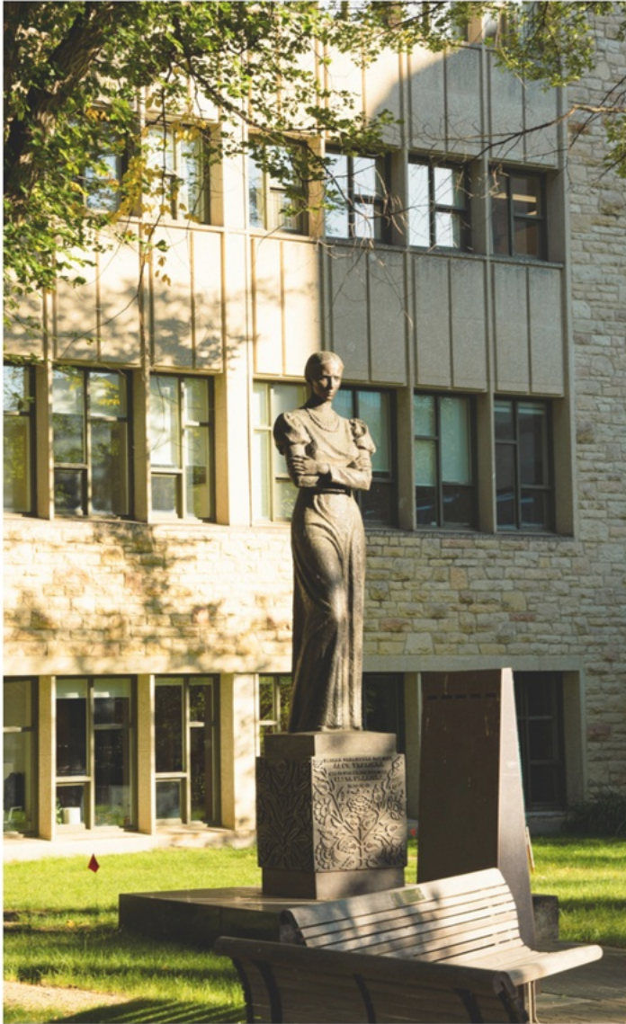
Statue of Lesya Ukrainka on campus | Jayde DesRoches (@JadedExposure)