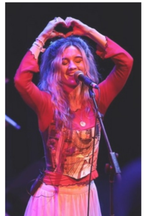
It was a wrap to the festival | @breakoutwest on instagram

As MTV puts it: "Your new favorite vocalist lives in Newfoundland."