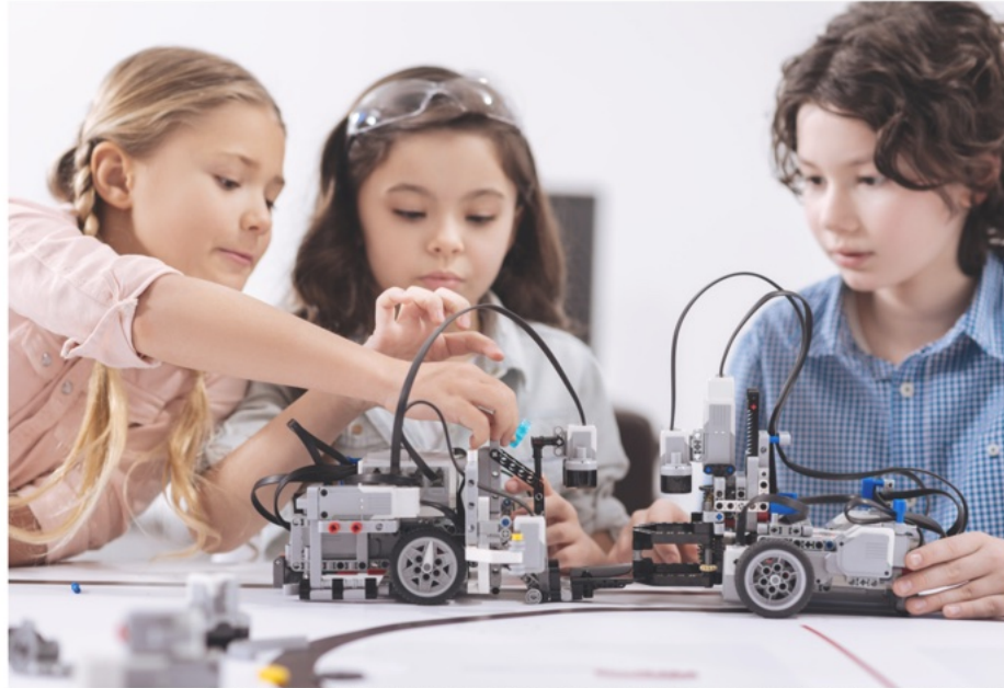
Focused group of kids working on table together

One bright sunny day during a workshop on the science behind how objects fly, my partner and I noticed that we didn't have one of the key components needed to do the activity. By this point the kids had already started their engineering builds. To