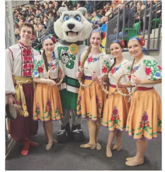
Howler with the Pavlychenko Folklorique Ensemble in 2022 | Pavlychenko Folklorique Ensemble