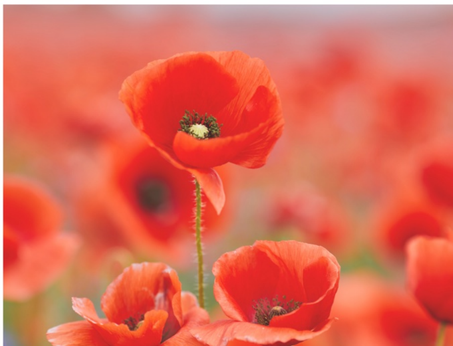
Red Poppies in a Poppies Field | Vetrestudio | Canva Pro

by the blood of the fallen. McCrae's poem had only popularized its inherent association with the somber reminder of the costs of war.